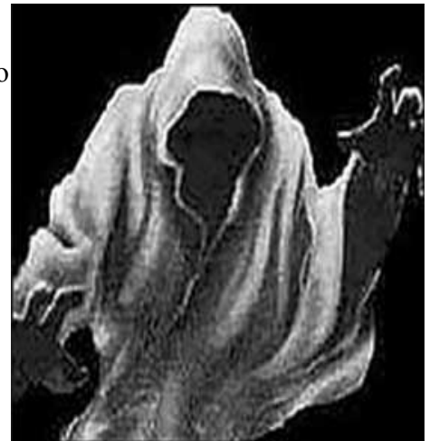
Illustration 3: For many, not being able to see the Strangers face is the most terrifying aspect of the vision

This is where SP and hypnagogic hallucinations merge into a lucid nightmare, leaving sleepers dazed, horrified and scared to go back to sleep for hours afterwards. In Medieval times the Incubus was the demon known to sit on women's chests to molest them. In Hawaiian society, the spirits are known as the Night Walkers . In Teutonic lore, the Doppelganger . And we can't overlook the fact that many alien abduction tales start with being paralyzed in bed.