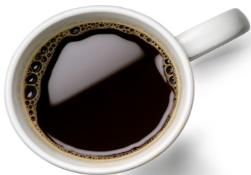
Illustration 5: Too many stimulants can mix up healthy sleep patterns and bring on SP

schedule is hard on our bodies. So, as much as possible, go to bed and wake up at the same times.