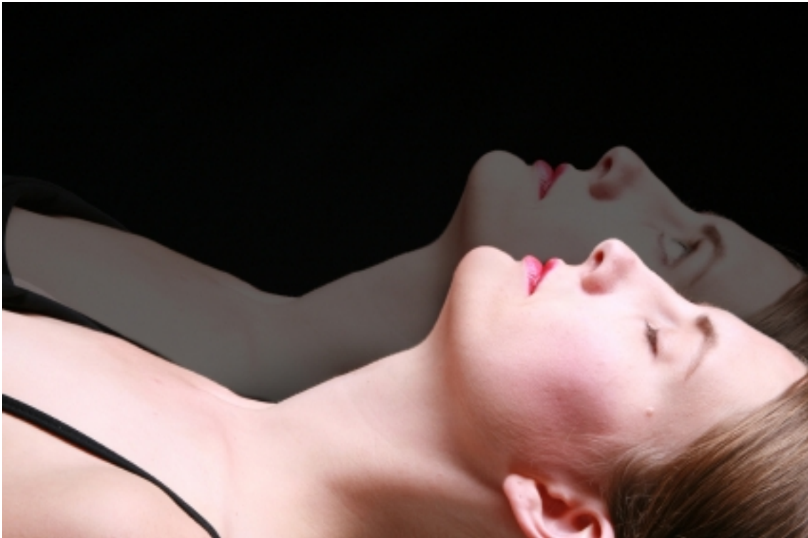
Illustration 2: During SP, the mind awakens while the body still sleeps

Biologically speaking, SP is harmless; it's perfectly natural if not accompanied by symptoms of narcolepsy or sleep apnea. The muscle paralysis occurs when our brain is flooded with the neurotransmitter acetylcholine, which suppresses muscle tone in all the major muscle groups that are not autonomic (such as the heart, the intestines, and the lungs). However, many lose sleep over SP, which contributes to insomnia and actually increases the odds of another SP attack.