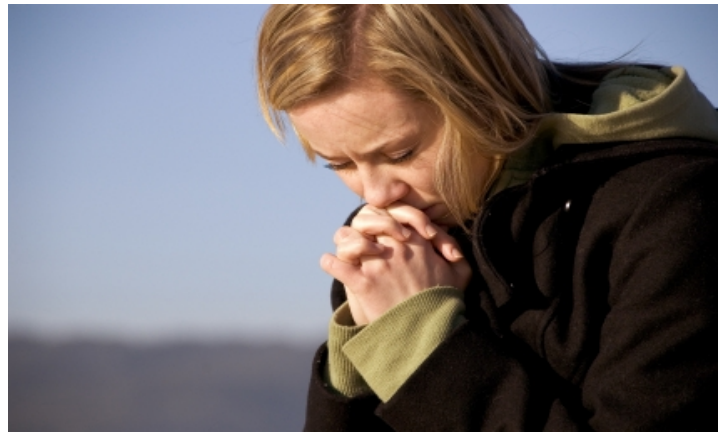
Illustration 4: Sleep paralysis often comes at difficult crossroads in life

And that's the balm to all these stories of demons, stranglers, and alien abductions. As I now see it, SP is an initiation into the dreaming arts. The calling is for light sleepers, conscious dreamers, and those who have thin boundaries, or what researcher Ernest Hartmann has called "vulnerability." The initiation can also come when we are at