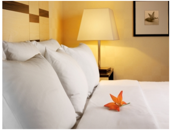
Illustration 6: Creating a sanctuary out of your bedroom is key to feeling safe

Some more ways to cope include adding bedtime rituals that create a “safe place” for sleeping, such as gentle music or aromatherapy an hour before sleep. Also, make a connection to your deep beliefs about the world: where can you “lean against” to help calm you down during fearful encounters? Having a sense of gratitude and the courage to love can break through the spell of fear in SP. For others, repeating the scientific truth that “this is normal, I am experiencing REM paralysis” is an effective way to keep fears from spiraling out of control.